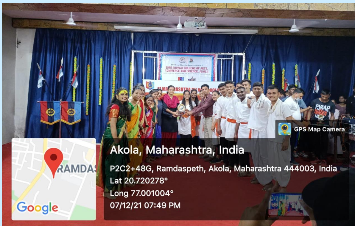
RUNNER UP TROPHY IN INTERCOLLEGE CULTURAL COMPETITION DURING CAMP