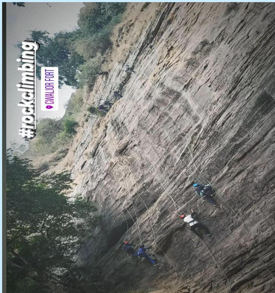
Cadet Shruti Nuttiwar–All India Rock Climbing Training Camp at Gwalior M.P (Year 2021)