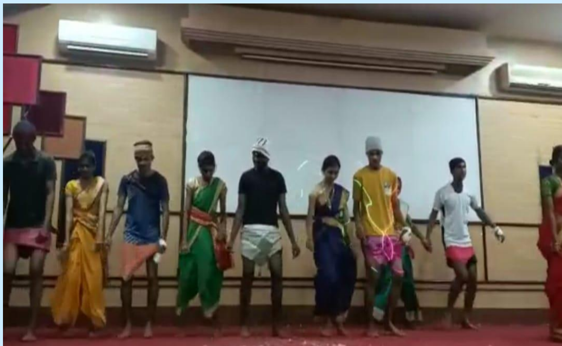
CULTURAL EVENING DURING CAMP