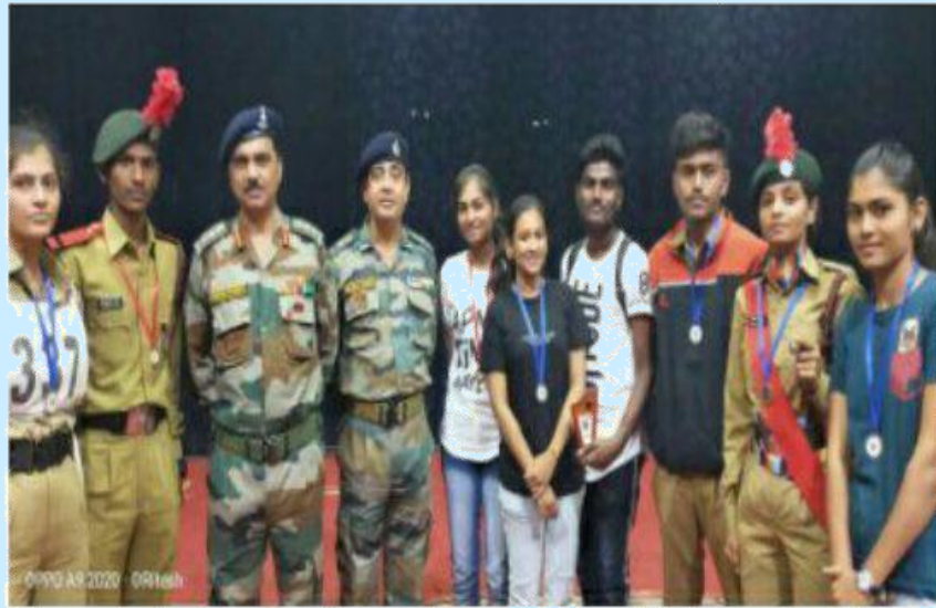
NCC cadets awarded with medals in various events in CATC Camp at PKDV Akola 2019